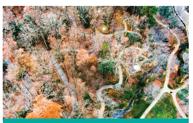
Gorla Ravinia Park - Tucked inside a patch of forest you'll find an impressively cultivated park perfect for a break from everything else.