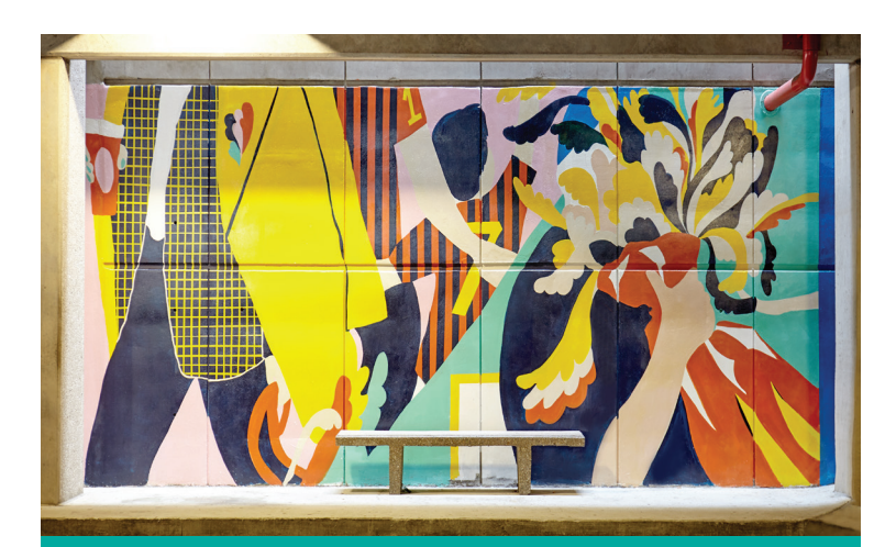
The Commuters - This beautiful mural graces the shuttle loop at Dunwoody Station, inspired by the many passersby at the district's busiest transit hub.